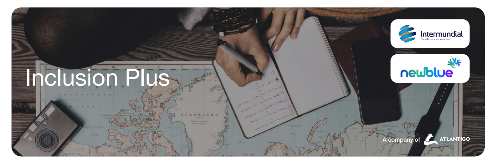
Table of benefits